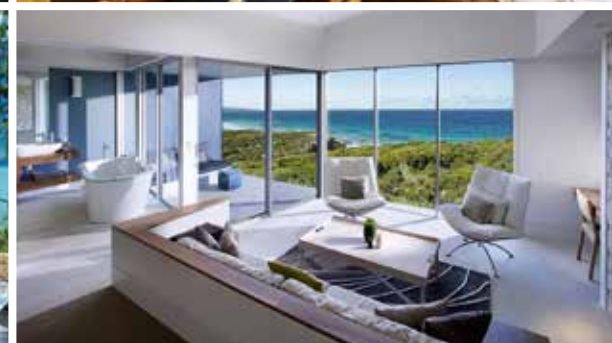
Southern Ocean Lodge, Kangaroo Island