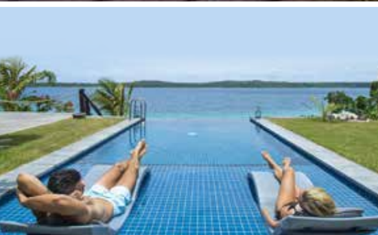
The Havannah Hotel, Vanuatu