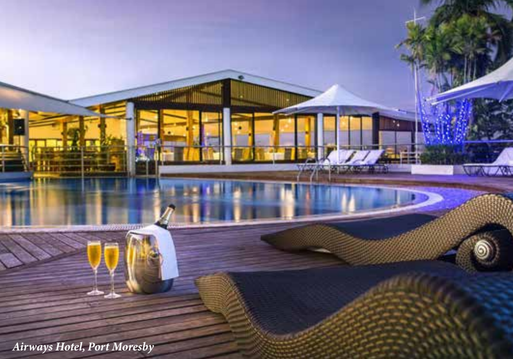
Airways Hotel, Port Moresby