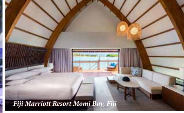
Fiji Marriott Resort Momi Bay, Fiji