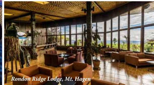
Rondon Ridge Lodge, Mt. Hagen