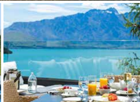
Rosewood Matakauri, Queenstown