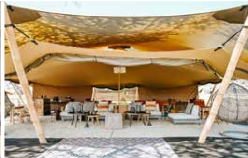
Wilderness Usawa Serengeti