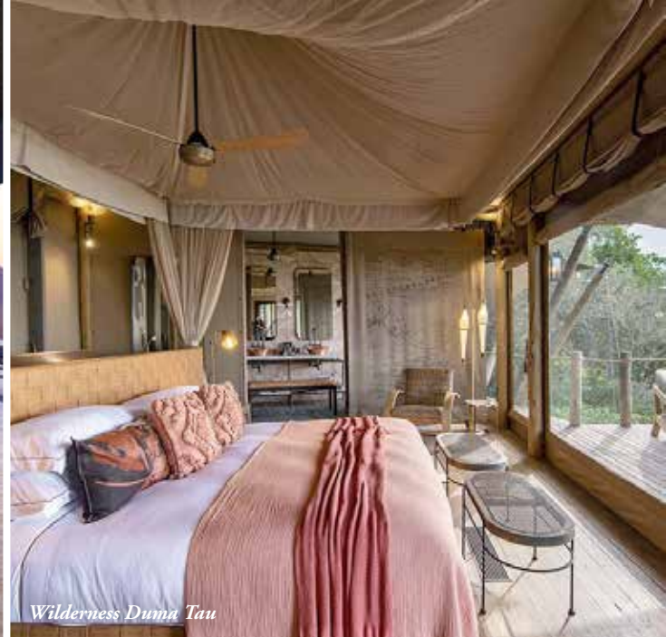
Wilderness Duma Tau