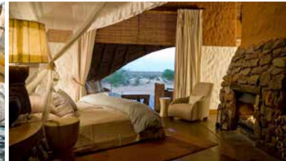
The Motse, Tswalu, Kalahari