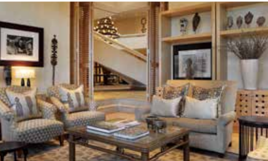
Saxon Hotel, Villas & Spa