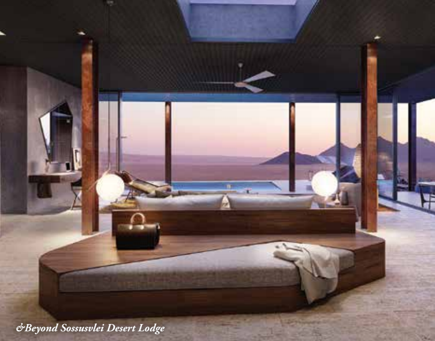
&Beyond Sossusvlei Desert Lodge