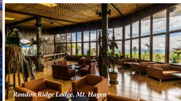
Rondon Ridge Lodge, Mt. Hagen