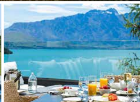
Matakauri Lodge, Queenstown