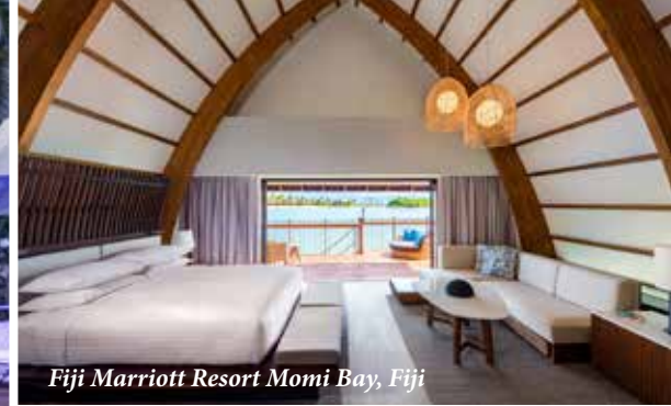
Fiji Marriott Resort Momi Bay, Fiji