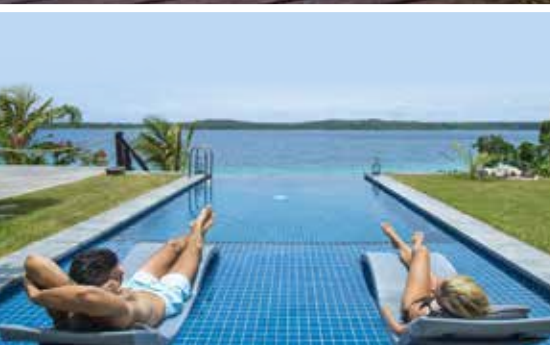
The Havannah Hotel, Vanuatu