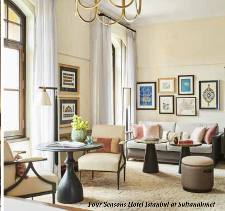
Four Seasons Hotel Istanbul at Sultanahmet