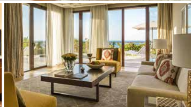
Four Seasons Resort, Tunis