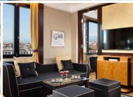
Principi di Piemonte Hotel, Turin