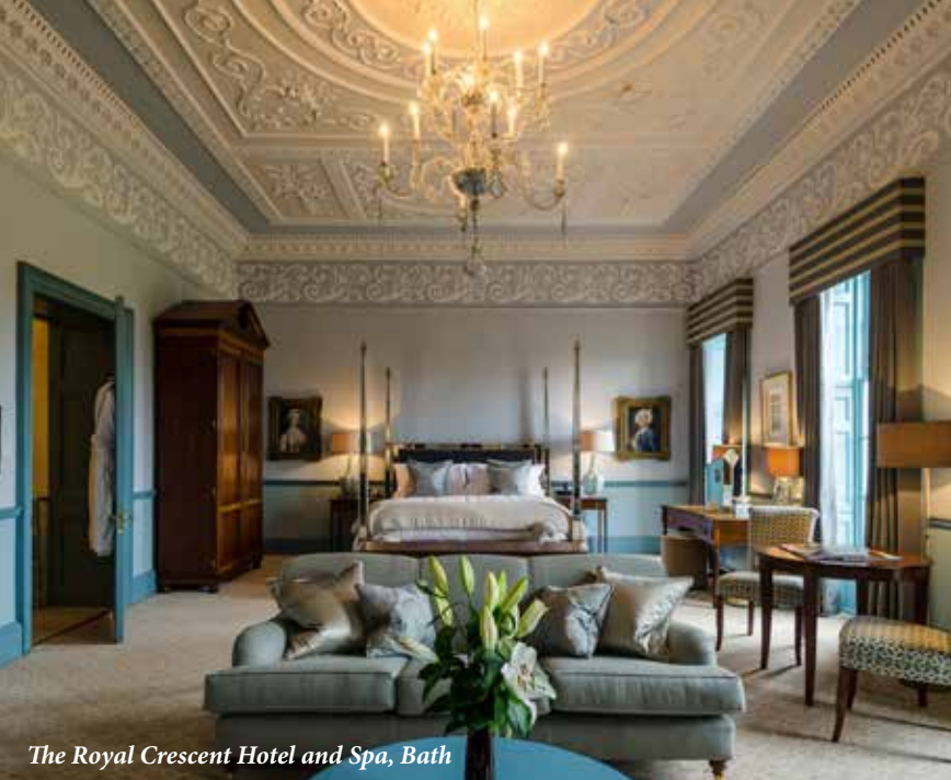
The Royal Crescent Hotel and Spa, Bath