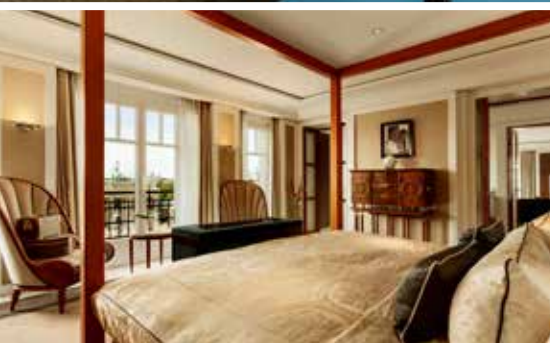
Hotel Adlon Kempinski, Berlin