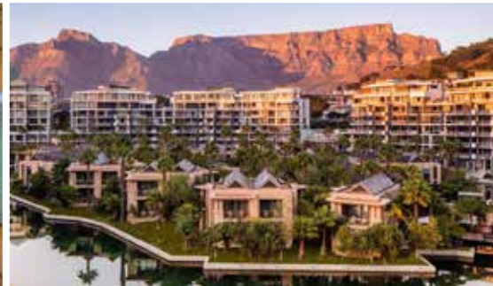
Saxon Hotel, Villas & Spa