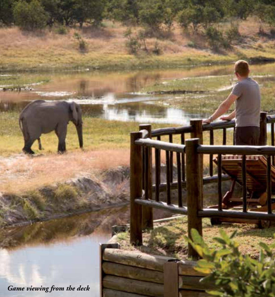
Game viewing from the deck