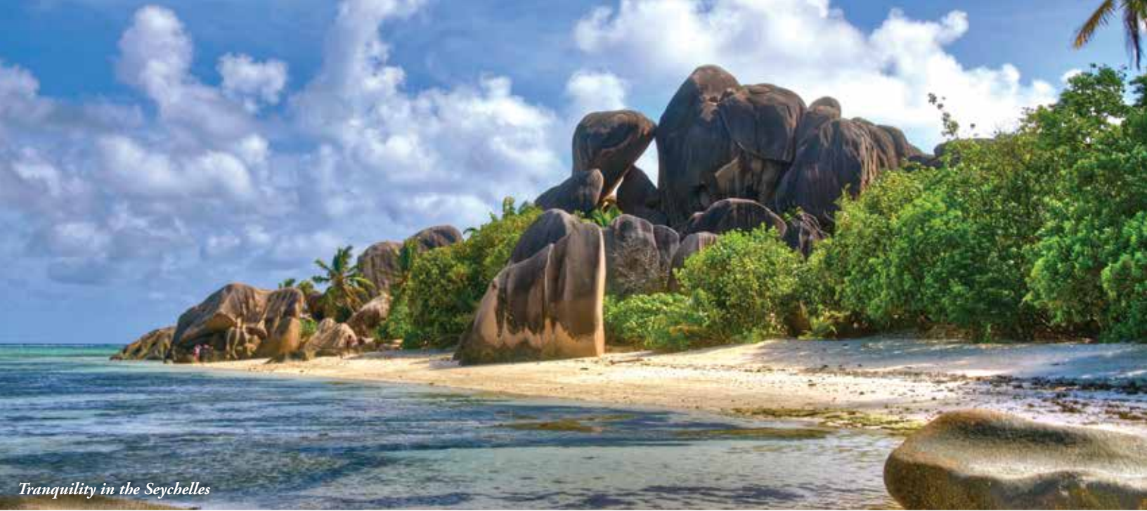
Tranquility in the Seychelles