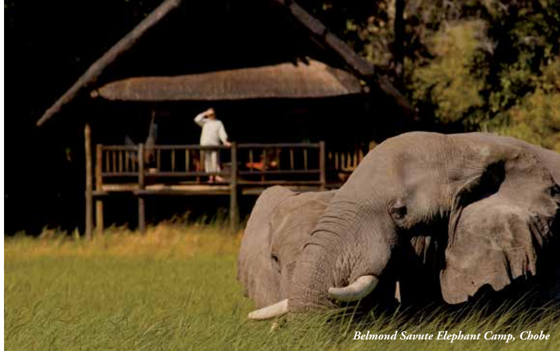
Belmond Savute Elephant Camp, Chobe