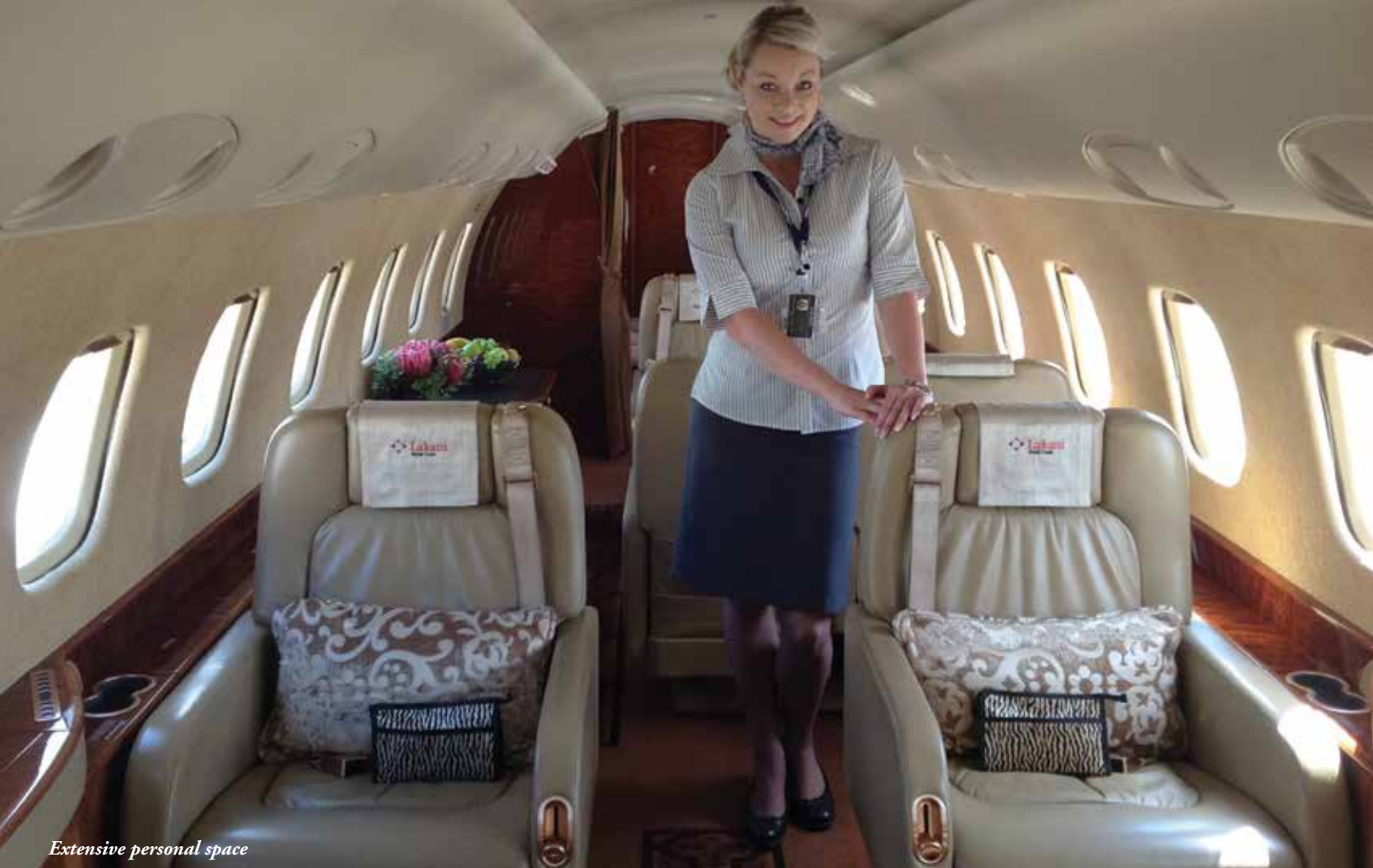
Extensive personal space