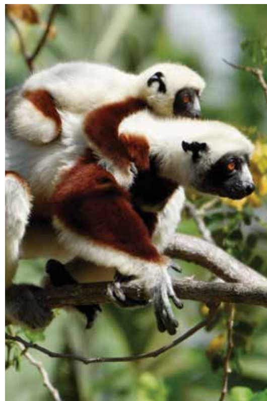
Lemur (Coquerels Sifaka)

Having developed in isolation, the island nation is famous for its unique wildlife and is considered a biodiversity hotspot. The resort is ideally located to visit much of the fauna that Madagascar is famous for. Travel through Moramba Bay and the private nature reserve located just behind the resort. See many species of the world famous lemurs, iguanas, birds of paradise, kingfishers, hummingbirds, ibis, eagles, and flying foxes.