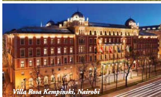
Villa Rosa Kempinski, Nairobi