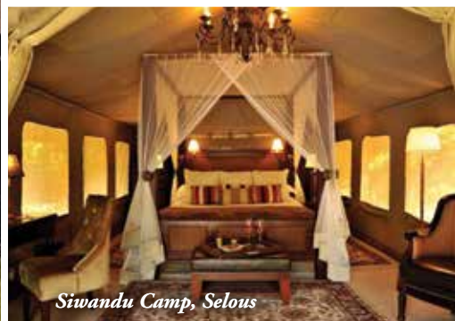
Siwandu Camp, Selous