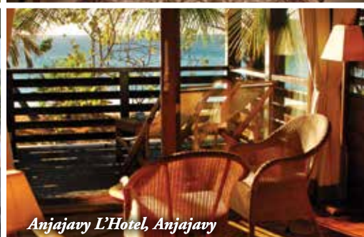
Anjajavy L'Hotel, Anjajavy