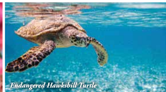
Endangered Hawksbill Turtle