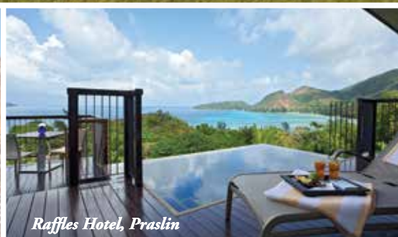
Raffles Hotel, Praslin