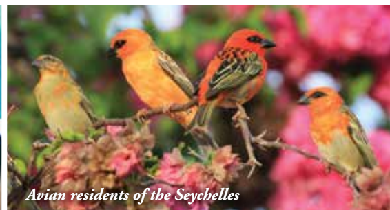
Avian residents of the Seychelles