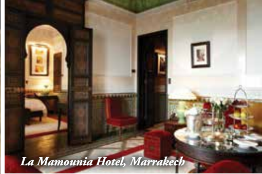
La Mamounia Hotel, Marrakech