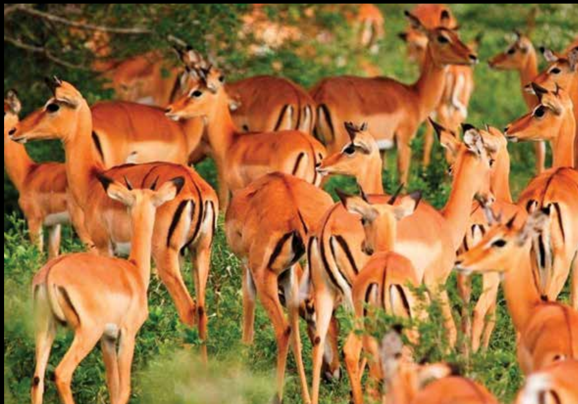
Herd of young impalas